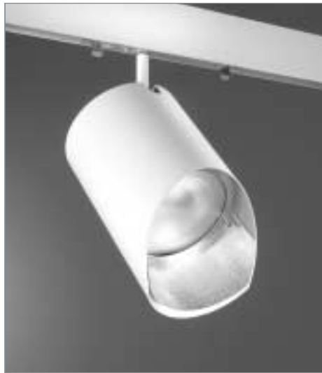
M06PAR36-9iD with 45° tilt shown in Deep BusRun.